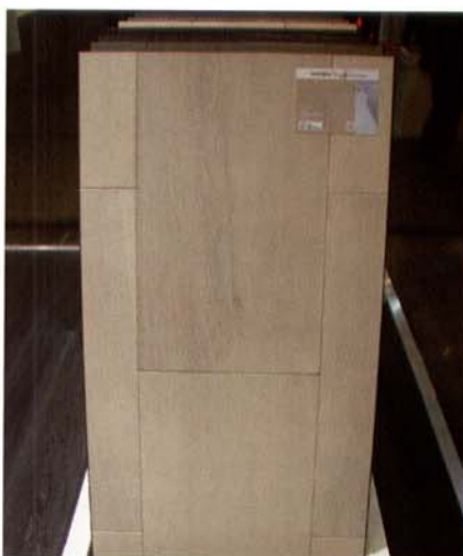
The Pure Design flooring element carries tile-like patterns of 600 x 300 mm.

The Dutch wooden flooring importer, Fetim has pursued its creative propensity from the Black & White collection launched in 2009 to this year's Pure Design line. The 2010 Solid-floor invention excels with stylish colours and an unconventional shape. The purist yet natural colouring of the brushed surface corresponds to the tile-like plank size of 600 x 300 with four-sided bevelled edges. These tiles are part of a multilayer flooring element of 2,400 x 300 x 15 mm.