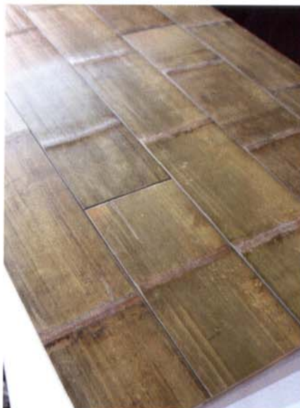
Moso Forest is the real outer bark of the bamboo cane used for a parquet wear layer.

The Dutch bamboo specialist, Moso, has developed and patented a special process to press the outer part of a bamboo cane into a flat 6 mm panel –making this very hard surface available for floor covering use. The bamboo bark is then glued to a 3-ply slat with a total thickness of 18 mm.