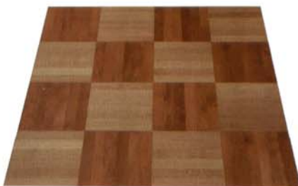
Light natural Ali PreMass slats could be combined with the darker, 190 degrees heat-treated Living Thermo Ash.

Al Parquets manufactures pre-finished, solid wood slats. Both the Trend and Living lines from the PreMass and SuperPreMass collections can be installed either in a herringbone or in a cube pattern. Of course, shipdeck, ladder and English patterns are also possible.