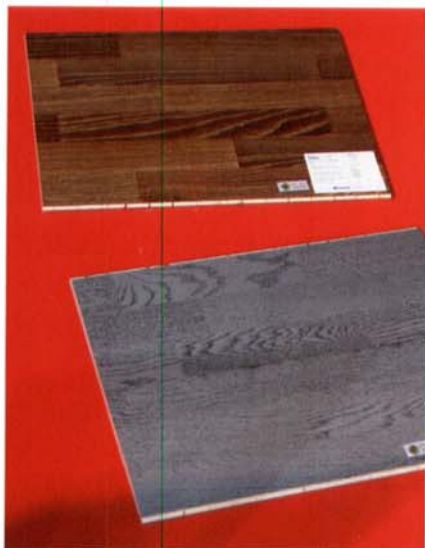
The changing colours of Salsa Ash Cognac Purple Rain cannot be displayed in a picture but the metallic effect of Salsa Oak Silver Star is obvious.

Salsa is basically an engineered, 14 mm thick parquet with a 3-strip design. The wear layer of 3.6 mm is coated using Proteco lacquer, Proteco Natura, or Proteco oil. The parquet elements can be installed with a glueless locking system. Tarkett offers a guarantee of 30 years for residential use.